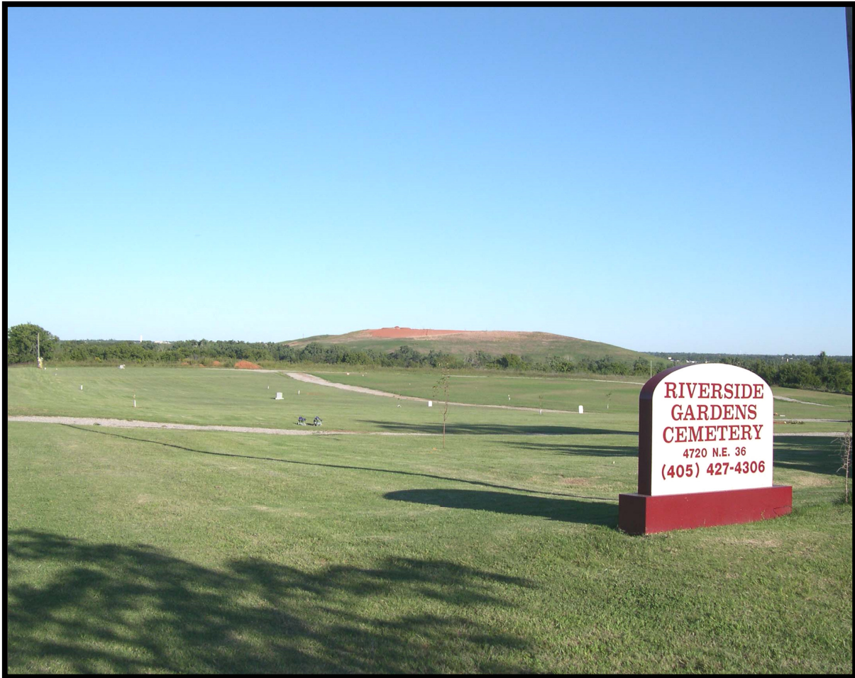
New Cemetery 2006